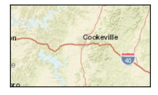
July 26, 2019