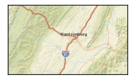
July 26, 2019