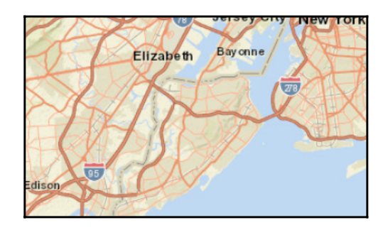
August 15, 2019