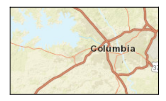
August 15, 2019