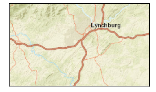
August 20, 2019