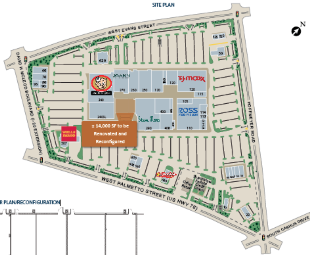
PROPOSED FLOOR PLAN/RECONFIGURATION